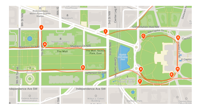
Figure 2: Sample Strava Segments on the National Mall in Washington, D.C.

Imagine a government official making a statement that contrasts crowd sizes at two major political events. If such a statement claims that one of the crowds was substantially larger than the other, one would then assume that this can be verified or falsified in a number of ways, e.g., analysis of photographs. The problem with such an approach is relying on the inexact art of people counting and adjusting for different times, view points, and so on. Consequently, one could rely on proxy information such as metro usage statistics for which exact data are readily available. Metro statistics are not the only source of such information, however. The impact of a large (or small) number of people in a relatively small area has a ripple effect on the amount and types of activities that occur within a city. Typical activity patterns such as recreational cycling or running will be affected by the density of people in a specific area within a city. Similarly, transportation patterns are influenced not only by road closures, but also by requests for taxis and ride-share services. The density of people within a certain region can have a substantial impact on these activities, and this impact can be quantified via analysis of spatial data.