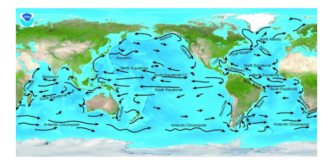
Figure 3: Visualization of major ocean currents throughout the globe.